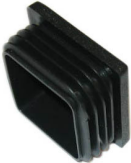
4 X D