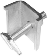
4 X A